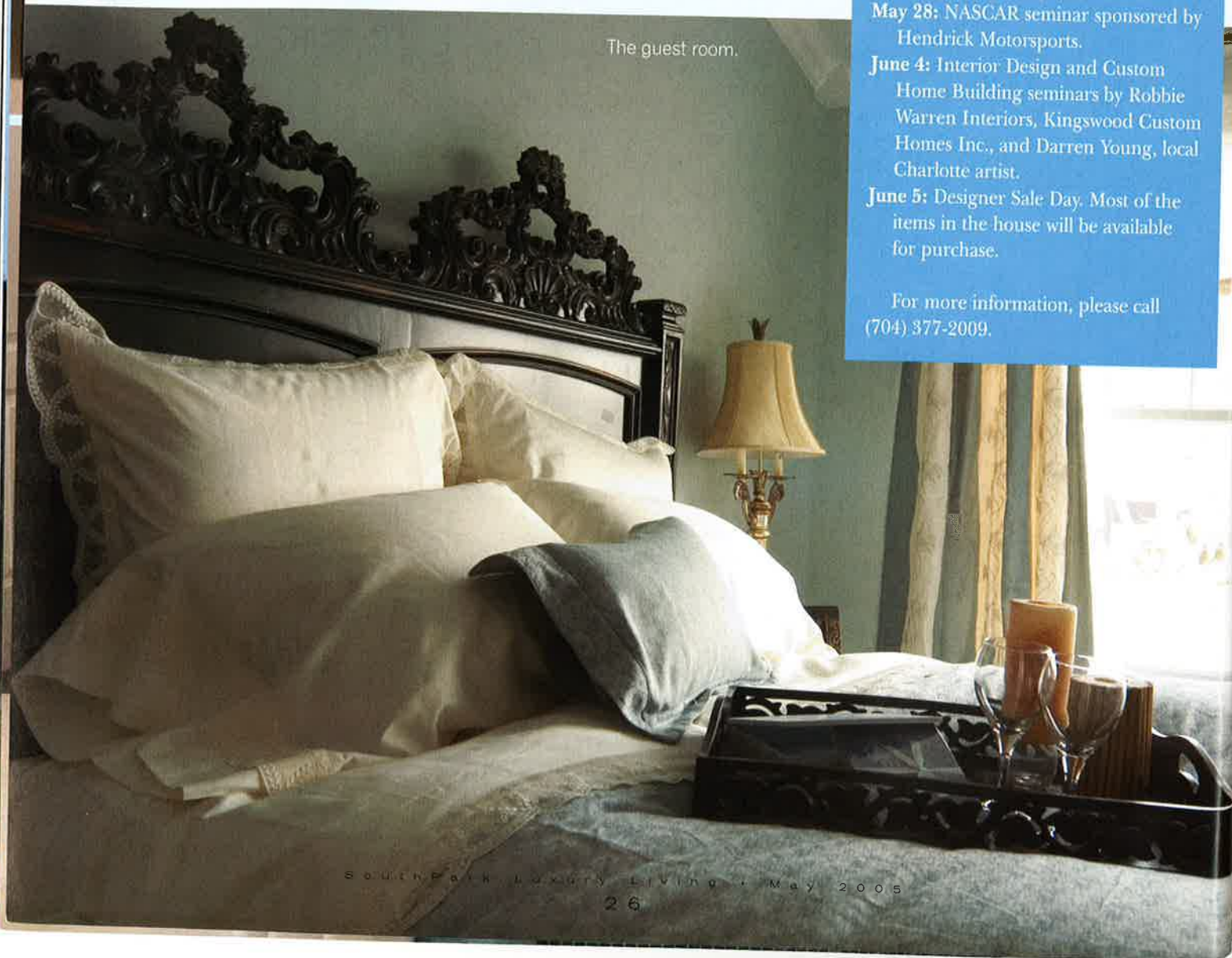
The guest room.