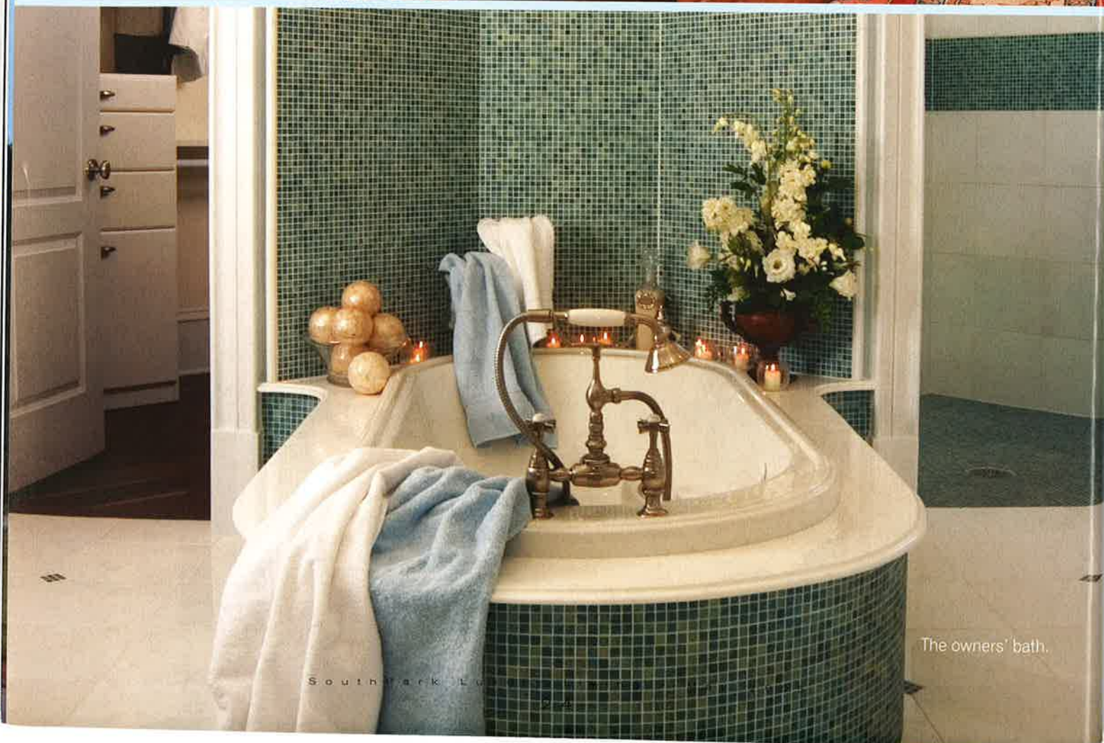
The owners' bath.