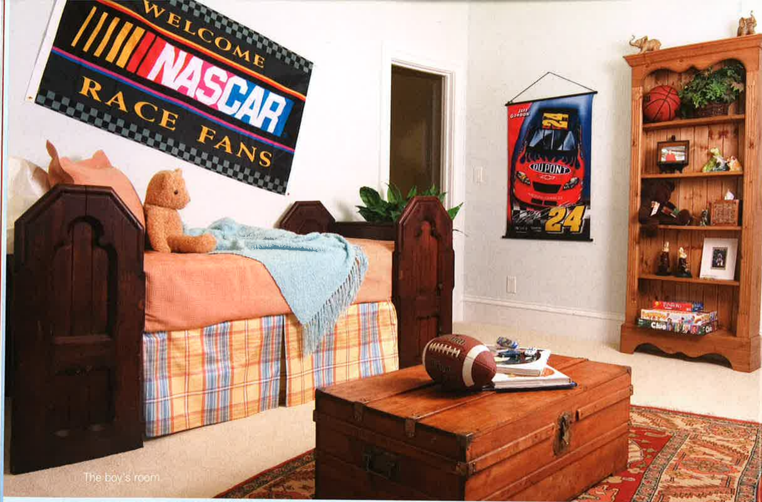
The boy's room