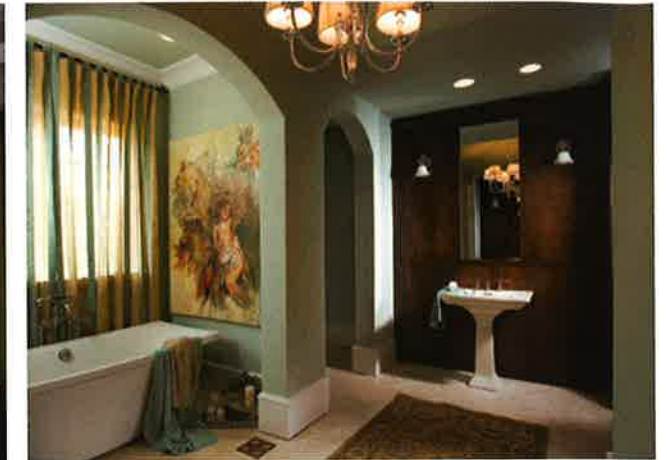
Wood paneling in the master bath conceals built-in shelving, providing homeowners with needed storage space while conveying the impression that the space was converted from use as a library.

While this home might not be set against the Scottish moors, it boasts a striking view. "We have an infinity edge pool overlooking Skycroft's main