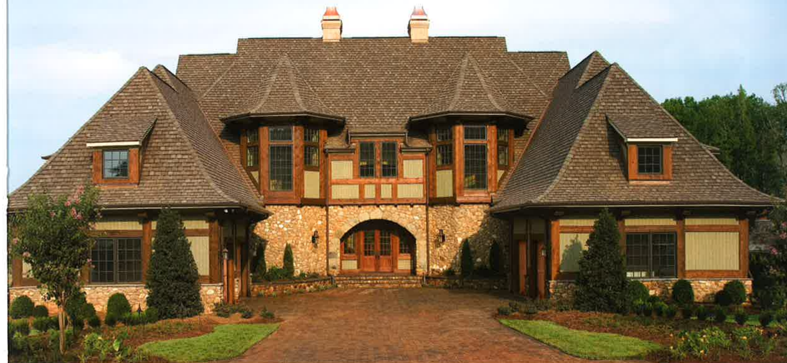
Authentic stone work, heavy cedar beams and v-groove cedar paneling lend a true Scottish flair to this elegant estate, the sale of which will benefit the Ronald McDonald House of Charlotte.