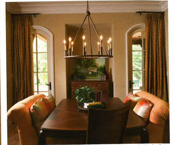
Updated furniture and surprising colors give the interiors the look of a European manor that has been thoughtfully refreshed over the years.

That's displayed in places such as the master bath, where extensive wood panels conceal built-in shelving. "The false walls provide wonderful storage, while the room looks like a library in a castle that has been converted into a master bath," she says. Other touches, like round backsplash tiles and