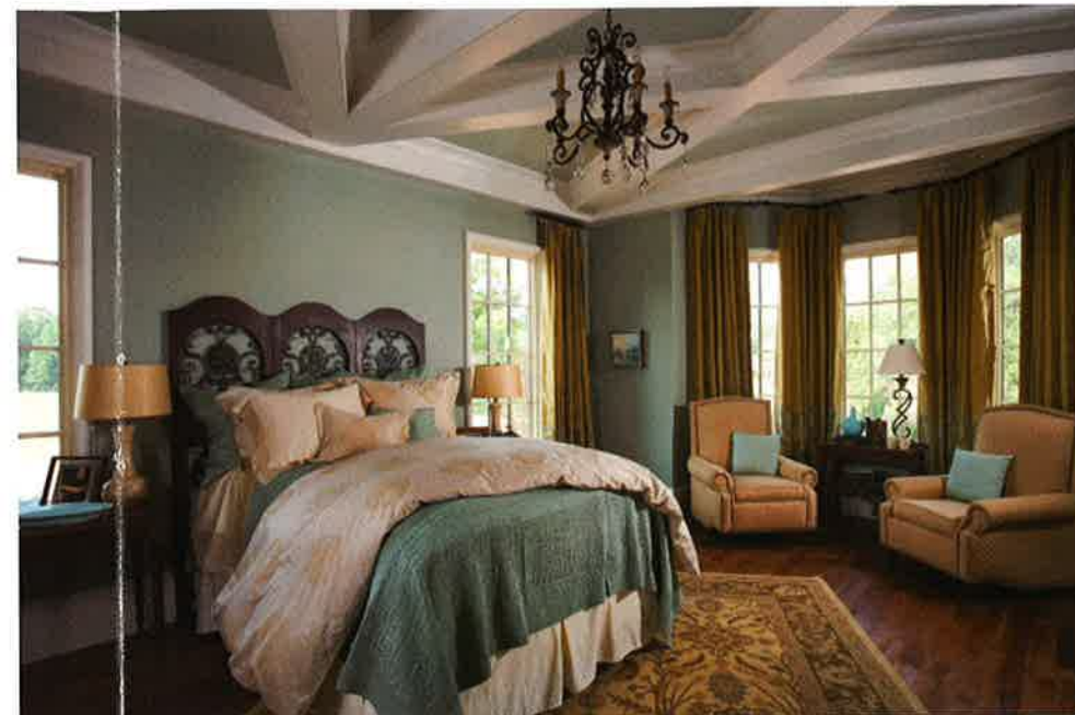
Above: Luxurious bedding, comfortable furnishings and elegant touches such as a crystal chandelier create a welcome retreat in the master suite.