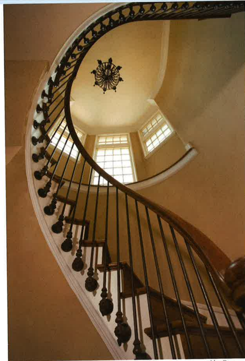
Unique touches can be found throughout the Scottish country estate created by Conger Builders, such as the distinctive placement of the balusters on this curving staircase.

That will be evident as soon as visitors step across the threshold and enter the foyer, where the walls and a modified groin vault ceiling